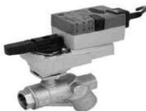
PICV Valve (Option)

** Front Blade, Louver and Sweep functions are available for only model CFEB04-12