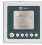
Digital wired control

best suit your needs with new privileged mode and function, elegant appearance, and simple use.